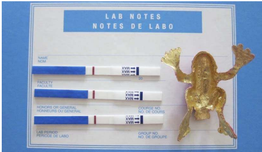
Figure 3. The negative pee-stick tests used by the couple after their performance of the Xenopus pregnancy test.

pregnancy test. “Once we knew we’d have to do it, we ran over to a friend’s house as fast as we could to find out,” the couple wrote in a blog post.