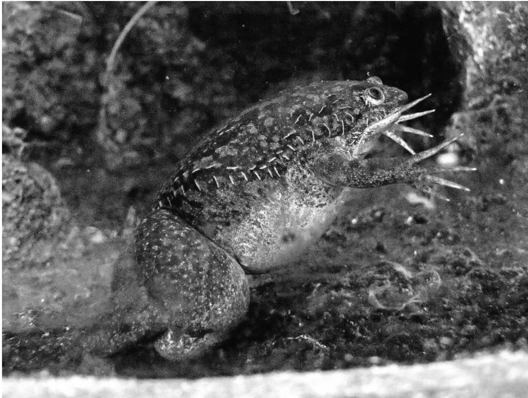
Figure 2. An African clawed frog ( Xenopus laevis ) resting underwater in an aquarium at Ueno Zoo, Tokyo. Photo by Peter Galaxy. Creative Commons Attribution-Share Alike 2.5 Generic, 2.0 Generic, and 1.0 Generic license.jpg

human families, meant that Loretta had no choice but to participate in our experiment. We purchased her with a credit card from 1-800- Xenopus , the toll-free hotline for a specialty laboratory animal supply company (fig. 2). Still, Loretta helped illustrate a deep kinship shared by humans and frogs—a similar biochemical makeup shared across divergent evolutionary lineages, with reproductive functions triggered by shared hormones. Once viewed as primitive creatures by experimental biologists, Xenopus frogs were formerly thought to be unable to experience feelings of pain or fear. But recent research has led to the revision of these earlier assumptions. According to a laboratory manual published in 2010 by the Taylor and Francis Group, “ Xenopus have all of the neuroanatomical pain pathways as seen in mammalian species, and thus, like mammals, they are capable of experiencing pain.” 26