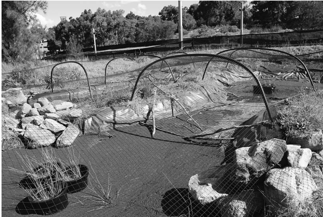
Figure 4. A purpose-built pond for green and golden bell frogs on top of a remediated landfill. Netting keeps out birds and other predators, but the chytrid fungus is still able to get inside this infrastructure of care. The pond needs to be periodically topped up with water since it is leaking into the landfill below.

lives on frog skin and reproduces via tiny spores that use a flagella to swim through the water column, much like a human sperm. While chytrids are eliminated from the water supply with the microfiltration system, these tenacious parasites are entering the purified water farther downstream. The spores are able to live in small droplets of water and can move between bodies of water on the toes of birds, human shoes, or on the skin of some frog species that are asymptomatic disease carriers.