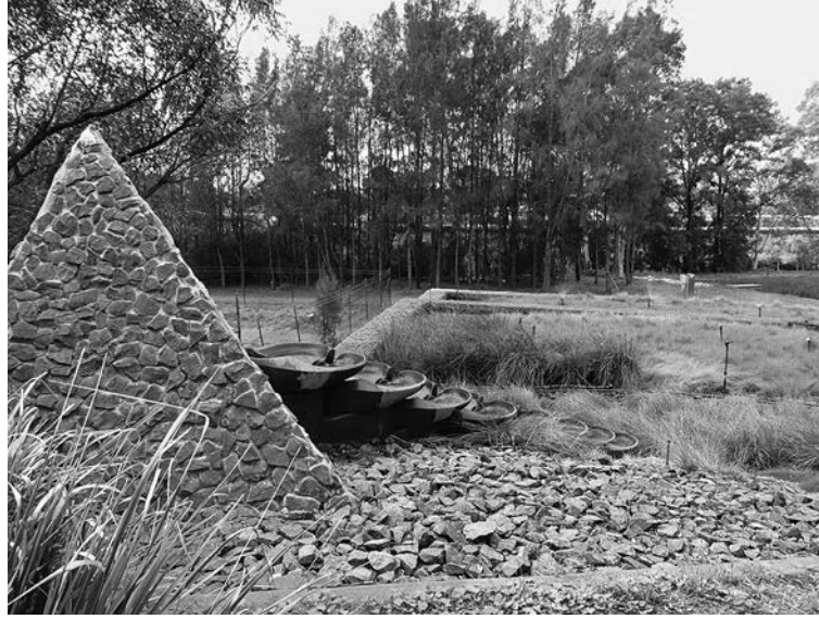
Figures 5 and 6. (Top) Green and golden bell frogs spontaneously emerged in polluted water at the Blaxland Landfill Leachate Treatment facility. (Bottom) Water from nearby landfills is treated here in a series of bioremediation pools. Silverwater Correctional Complex is visible in the background, behind a row of trees and a razor wire fence. Blaxland Riverside Park, on the opposite side of the prison, has a skate park and a playground on top of a remediated landfill.