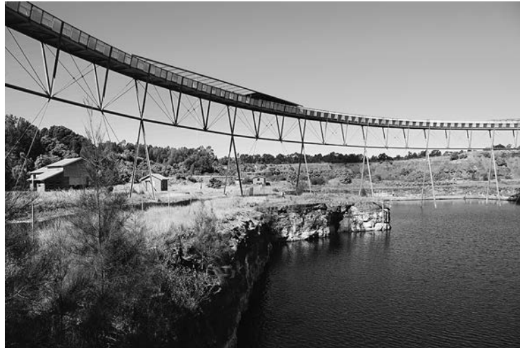
1 2 3 4 5 6 7 8 9 10 11 12 13 14 15 16 17 18 19 20 21 22 23 24 25 26 27 28 29 30 31 32 33 34 35 36 37 38 39 40 41 Figures 2 and 3. An elevated walkway at the Sydney Olympic Park allows visitors to view the habitat of the green and golden bell frog. High-rise apartment buildings are sprouting up in the landscape just beyond this postindustrial conservation zone.