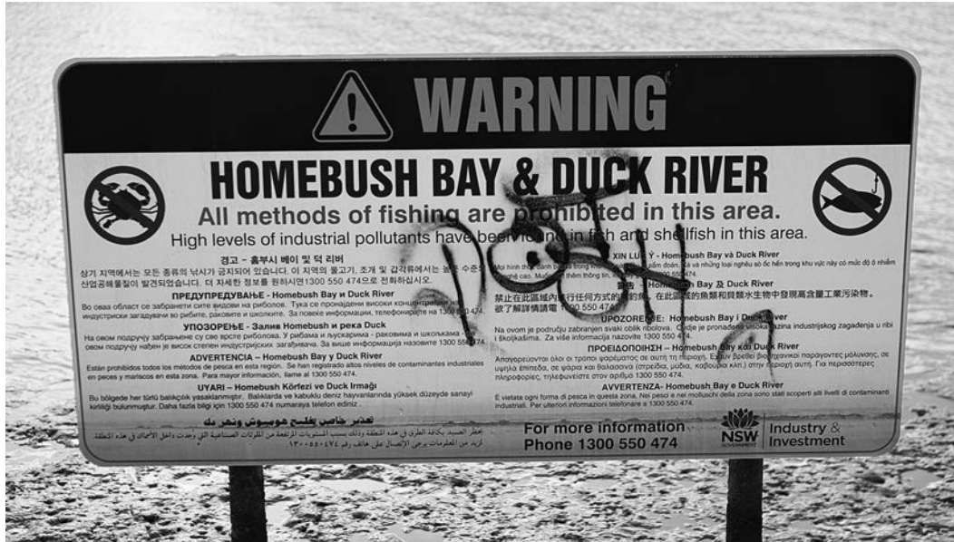
Figure 1. Fishing and swimming is prohibited in many parts of the Sydney Harbour because of legacy pollution.